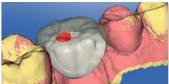
Fig. 5: Representation of the prosthesis in the CEREC software

N.B.: This protocol doesn't replace the CEREC° software operating instructions. It serves as a guide for the steps specific to the use of the TBR Ti-Bases. For more information, see the relevant user manuals.