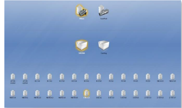
Fig. 2: Choice of the «ScanBody code»